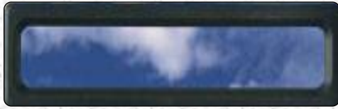
8" x 24"