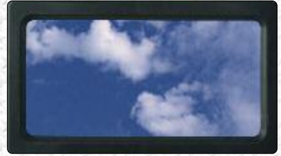
16" x 34"