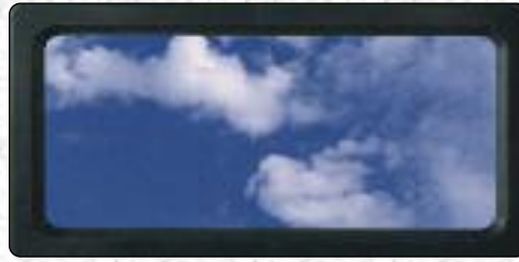
12" x 24"