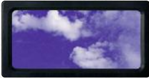
12 x 24