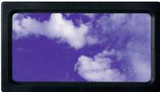
16" x 34"