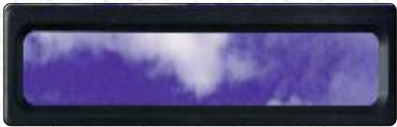
8" x 24"