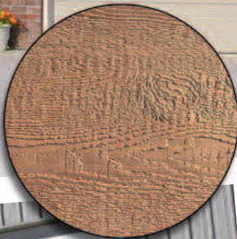
Model 31 Detail